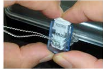
3. Press down the anchor of the seal and ensure that there are 2 clicks.

Identical serial number on housing and insert to prevent unauthorized component replacement.